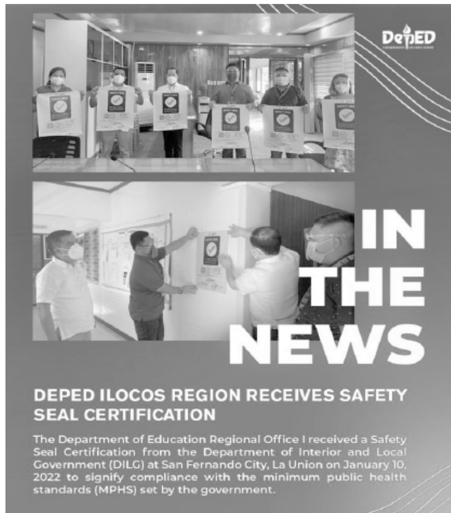
The Department of Education Regional Office I received a Safety Seal Certification from the Department of Interior and Local Government (DILG) at San Fernando City, La Union on January 10, 2022 to signify compliance with the minimum public health standards (MPHS) set by the government.