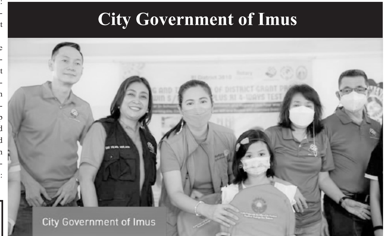
City Government of Imus